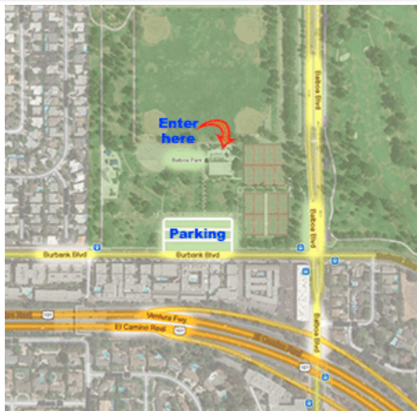
Balboa Recreation Center Location Map

The club was formed in 1988 for the purpose of enhancing skills, providing information and sharing the joys of working with wood. The membership reflects a cross section of woodworking interests and skill levels - both hobbyist and professionals. Annual dues are $35. Full-time student dues are $15.