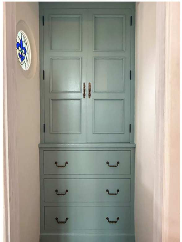
Trey and Carolyn showed a built-in cabinet they designed and built in a wedge-shaped area of their house. They used reclaimed 100-year-old Douglas fir and oak plywood for the drawer boxes. To keep the drawers aligned as they were pulled out, they used undermounted wooden runners