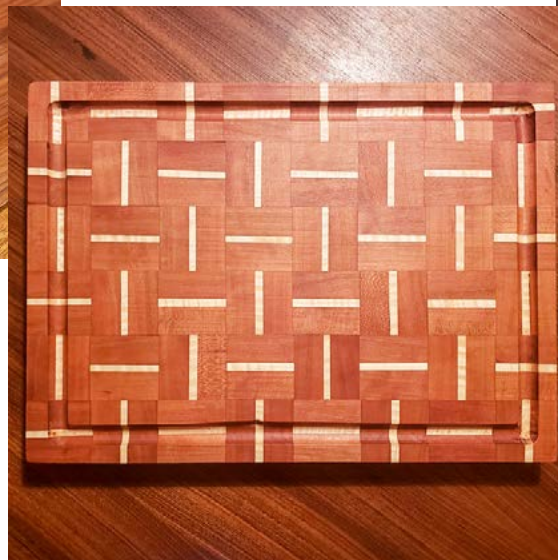
11 x 18 w/ mineral oil finish