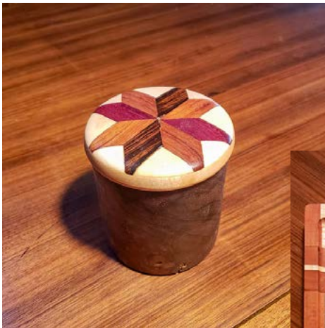
Oil & wax finish

So, my final warning out of all this: respect the vacuum hose!