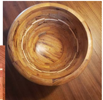
Sanding sealer, yorkshire grit and microcrystalline wax finish