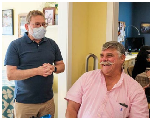
PAST & PRESIDENT