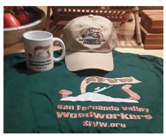
Go to This Link!

Be a fashion leader with the finest in woodworking attire.